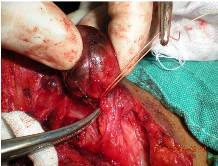
Fig. 2. Parathyroid Gland

Twenty eight patients (18.42%) were experienced to have post-operative complications. Fourteen patients had transient hypocalcaemia (9.2%) which was followed by serial serum calcium estimation and treated with intravenous calcium gluconate. Typically the patients presented 6-12 hours after