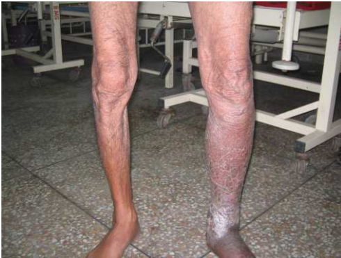
Figure 1: Disparity in limb size. Note the features of venous insufficiency in the leg.

On examination, the left limb was relatively larger than the right. The leg was swollen. The skin was dry, excoriated and pigmented and there were visible varicosities (Figure 1).